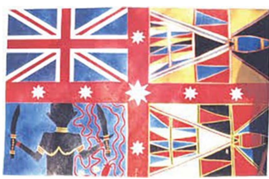
Figure 2. Warramiri 'Flag Treaty' Proposal