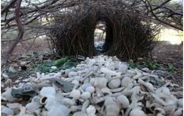
3. There are guardians and protectors outside – to stop theft of the treasured knowledge, but this can also protect and manage too much impact from outside influences and/or not acknowledging the authority of the guardians.