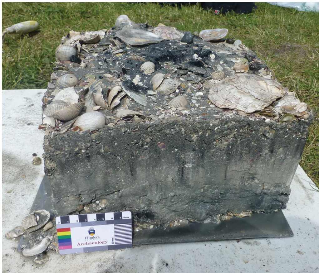
Figure 6. Block removal of an undisturbed section of the Hjørnø shell midden deposit and potential hearth feature.

and their associated sediments with geophysical survey using sidescan sonar and high-resolution three-dimensional bathymetry. Thus, we intend to establish the acoustic and geoarchaeological signals associated with submerged and buried midden deposits (Figure 6). We expect the results of this work to feed into the search for underwater archaeological material in the Pilbara region, and to be of global interest and relevance to underwater research.