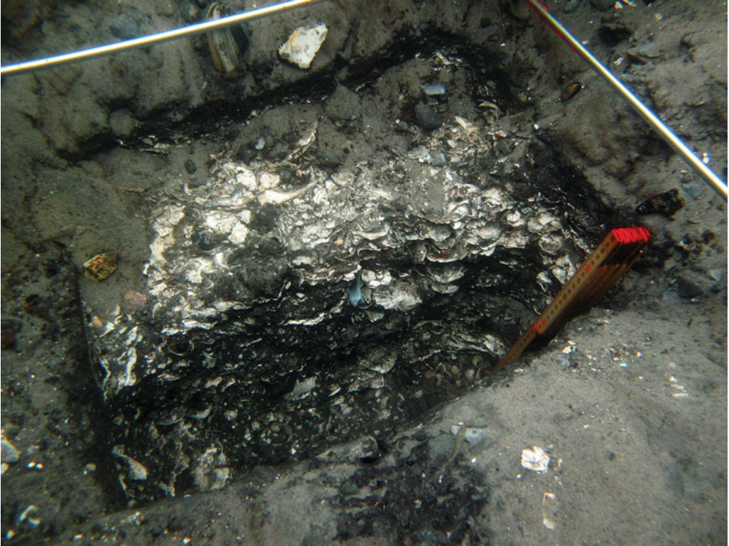
Figure 5. Excavation of an underwater shell midden at Hjarnø in Denmark (original photograph by J. Frederiksen, reproduced courtesy of C. Skriver).

The first step is to compile information on known onshore archaeological sites in the Pilbara region, their palaeoenvironmental and topographic associations, and to examine existing offshore marine survey data. This will be amplified using airborne survey combining bathymetric LiDAR equipment capable of achieving sub-0.5m scale mapping to water depths of approximately 10m, and high-resolution topographic LiDAR and stereo-imaging cameras. The objective here is to provide a detailed understanding of known onshore archaeological sites in their topographic and landscape setting, and to develop a preliminary understanding of the offshore bathymetry and underwater features of potential archaeological and palaeoenvironmental significance.