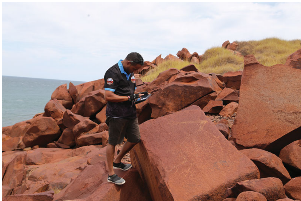
Figure 4. Murujuga Aboriginal Corporation ranger recording an engraving of a pelican on Enderby Island, outer Dampier Archipelago.

High-resolution bathymetry is already available over some parts of the shelf, showing submerged shorelines and other relict features of the ancient landscape (Brooke et al. 2017), along with satellite imagery indicating stone fish-traps close to the present shoreline. Early stone fish-traps (Figure 2), Holocene mounded shell-midden sites (Figure 3) and many thousands of rock engravings on the present-day coast (Figure 4) provide a basis for predictive modelling of underwater archaeological remains (McDonald & Veth 2009; Ward et al. 2013). There is also a substantial body of Indigenous knowledge about this ‘sea country’ throughout coastal Australia, including memories of now inundated traditional land (Bradley 2010; Nunn & Reid 2016).