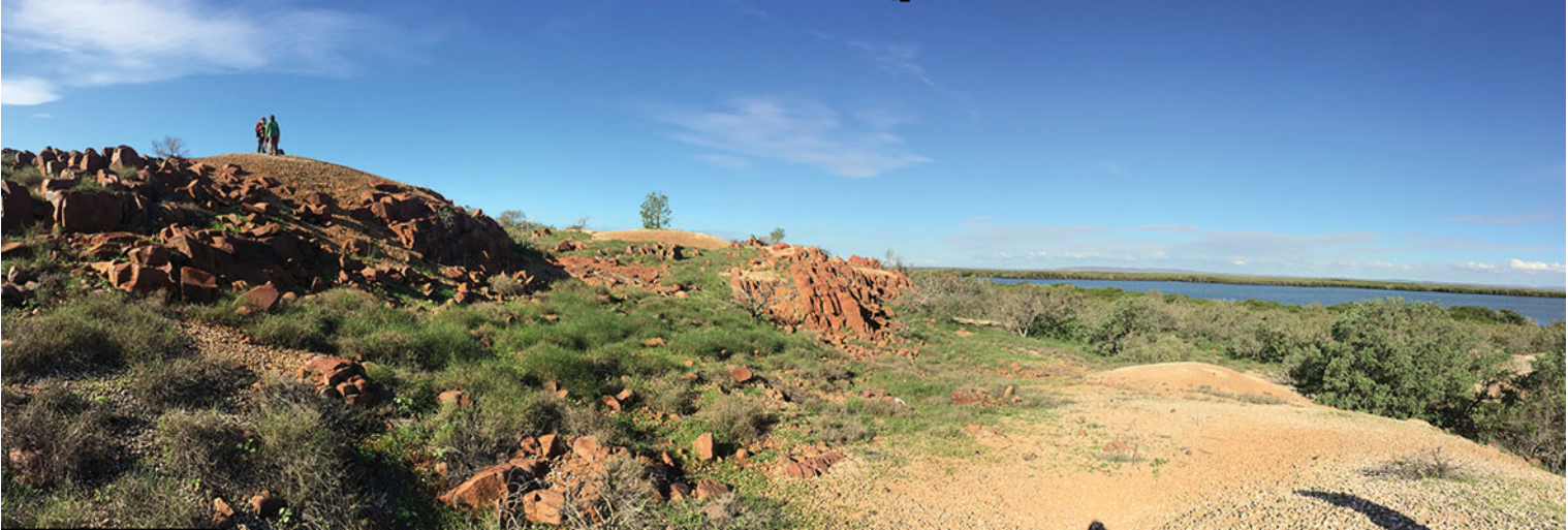
Figure 3. Mounded shell middens on the present-day coastline on West Intercourse Island, southern Dampier Archipelago.