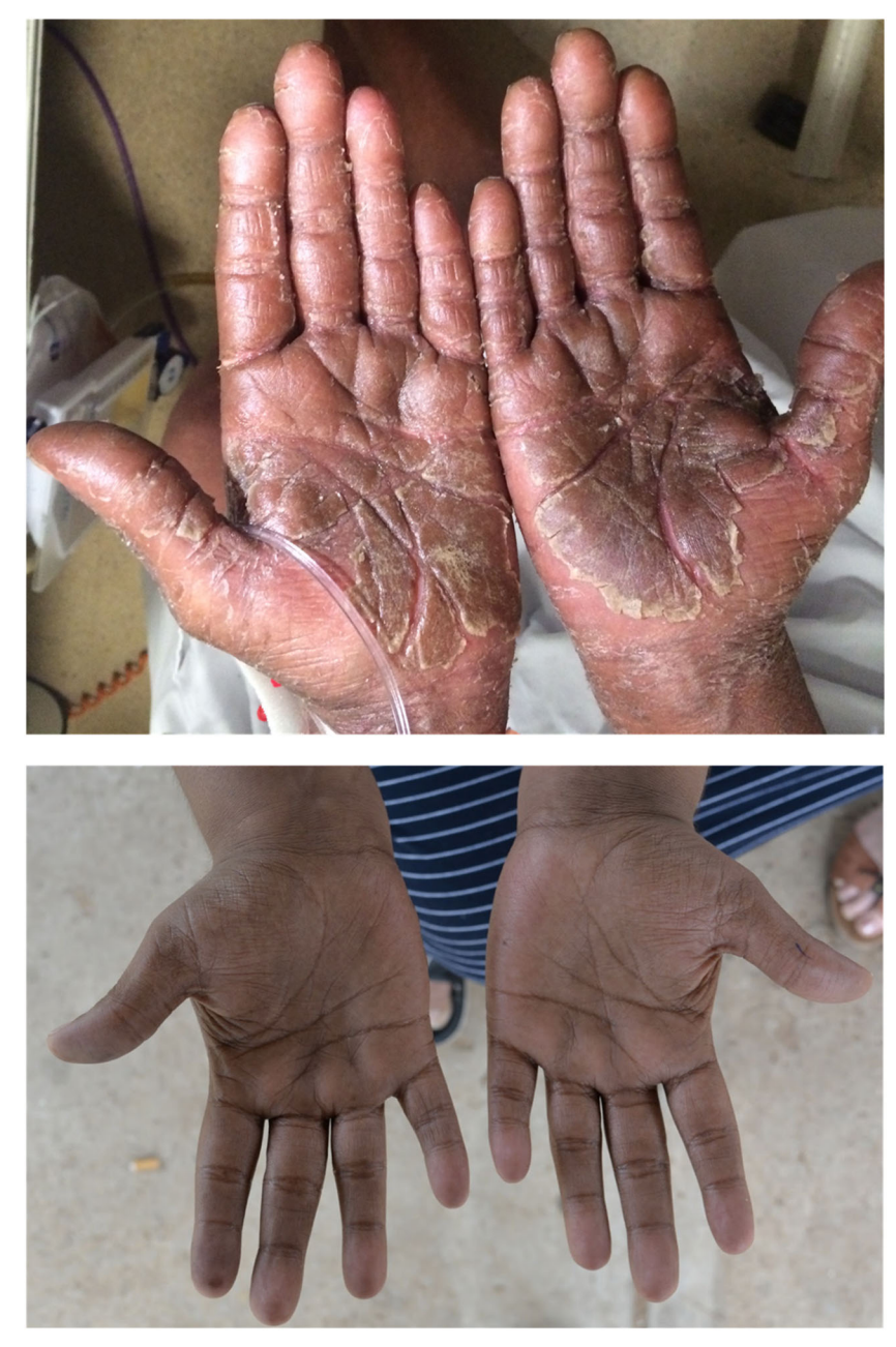
FIGURE 2 Photo of subject's palms at time of DRESS diagnosis (top) and at 2 years and 4 months after phenytoin was ceased